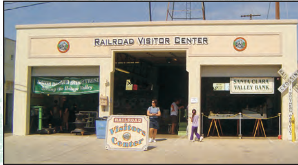
Santa Clara River Valley Railroad Historical Society's Railroad Visitor Center 455 Main St., Fillmore, California 93015