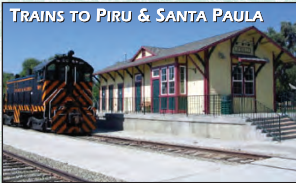
TRAINS TO PIRU & SANTA PAULA